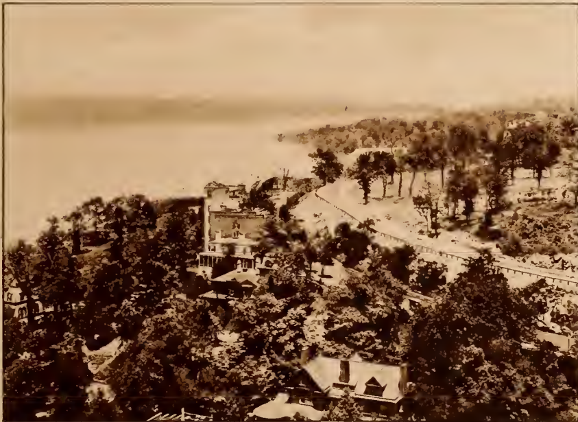
HUDSON RIVER WITH A VIEW OF PALISADES.